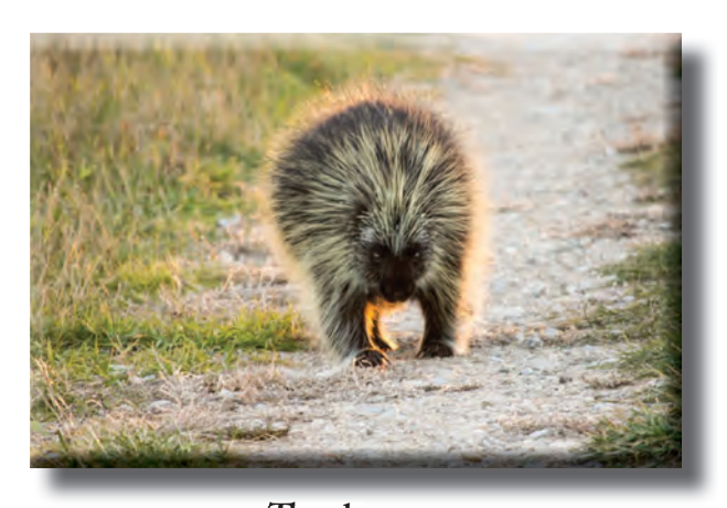
Thank you all for what you do to preserve the land, teach us about preservation, agriculture, environment and wildlife. What really is amazing is how you share it. We so appreciate this opportunity.